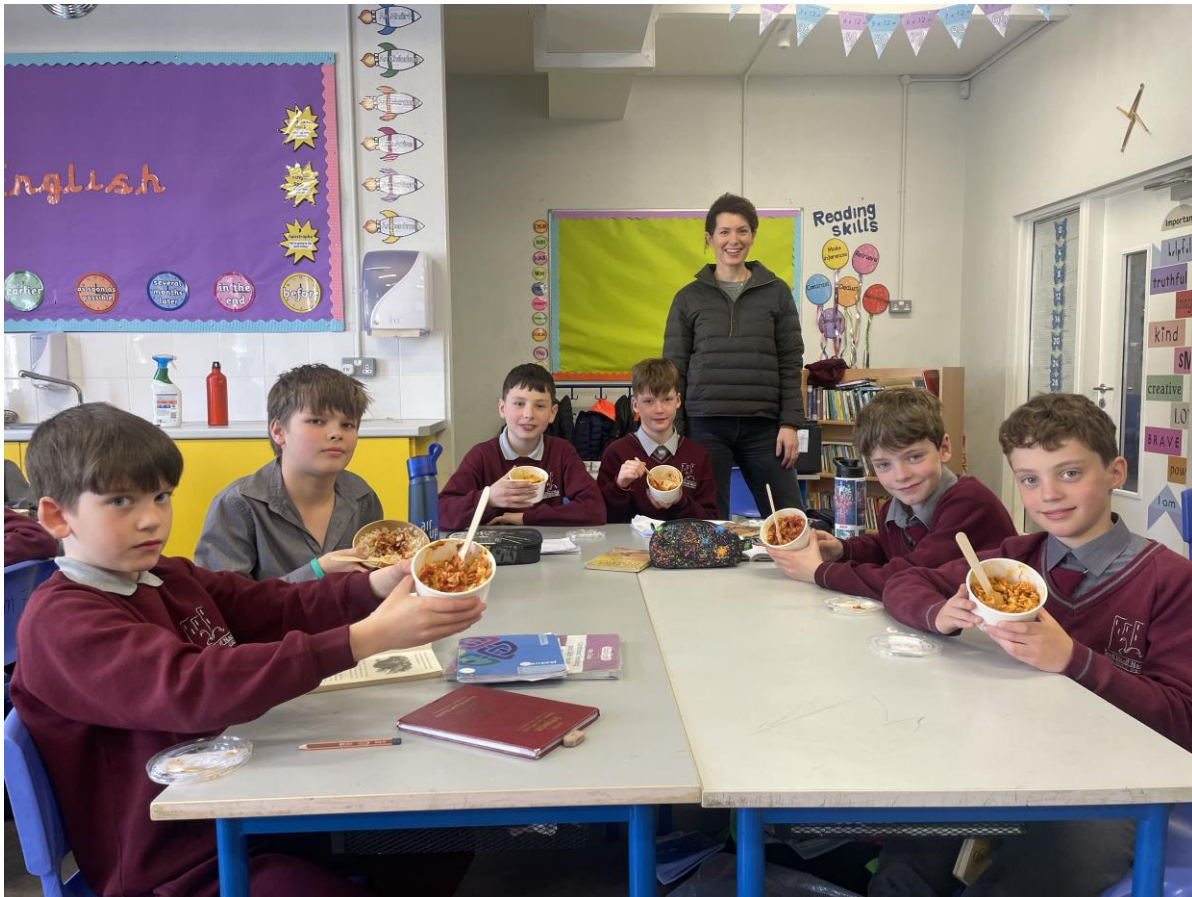
Pupils from Rang a 4 enjoying their nutritious hot lunch.

We are delighted with our Hot Lunch programme to date. Feedback from children is very good. If you have any feedback you'd like to share we'd be delighted to hear from you and pass on to the providing coming.